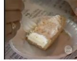
Fig. 3. Original Closed-captions: "the paper also mentioned that a local favorite breakfast is key lime pie. It seems a little odd to me that people eat pie for breakfast, but with the abundance of lime trees here in the Keys, I'm willing to bet that the price for a slice of pie..." Predicted words from video and audio: 'Rachael', 'like', 'gonna', 'yeah', 'key', 'right', 'eat', 'know', 'fun', 'just', 'good', 'great', 'food', 'fresh', 'time', 'town', 'local', 'lot', 'breakfast', 'thank', 'lime', 'make', 'best', 'cream', 'Keys', 'looks', 'affordable', 'come', 'prices'

where the variational posterior q(\theta|\mathbf{w}^a, \mathbf{w}^v) \sim \text{Dir}(\tilde{\alpha}) and E[\theta_k] = \frac{\tilde{\alpha}_k}{\sum_{k'} \tilde{\alpha}_{k'}} . Figure 3 shows an annotation example of a clip from the show $40-a-day (from the Food Networks chan-